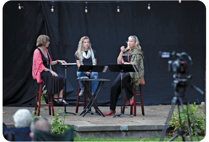
Bobcat Players perform in the park, 2020