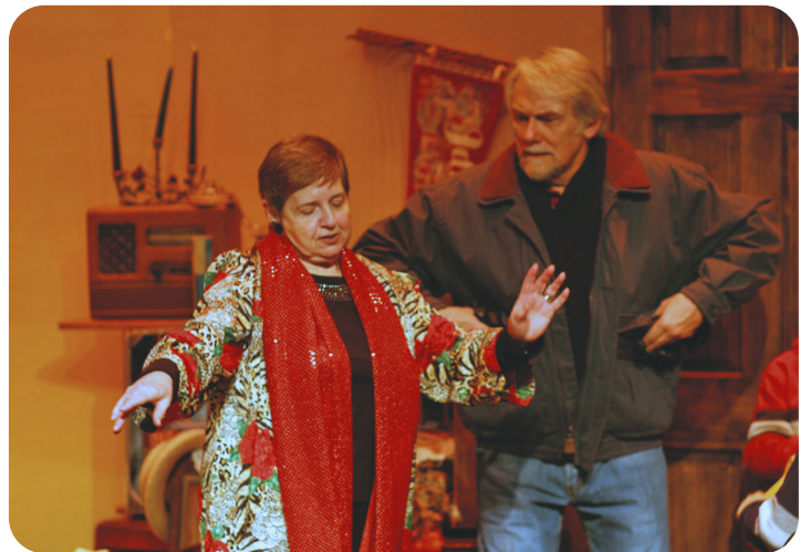
Unexpected Gifts, 2017