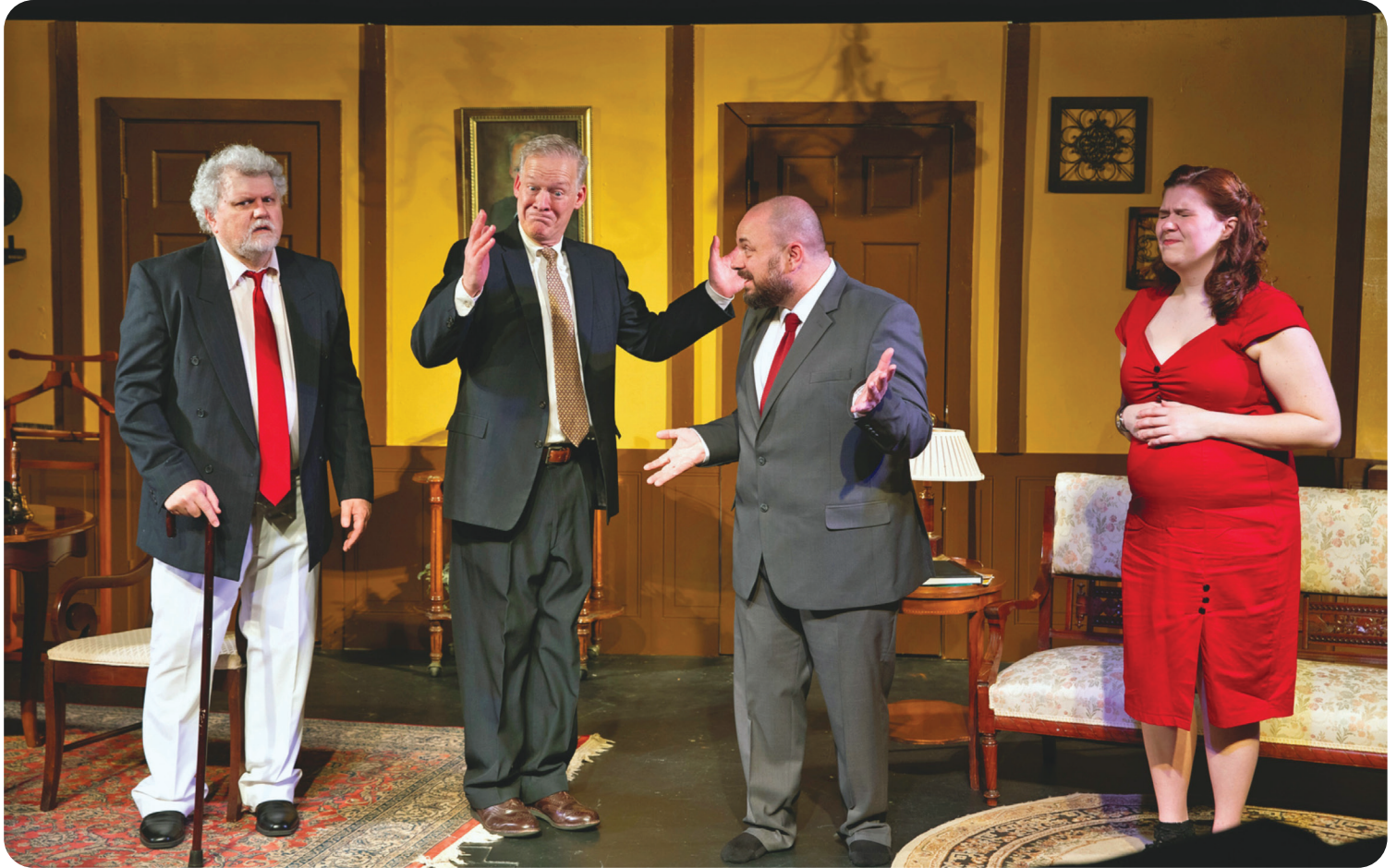
The President, 2023

group always sought a balance of reputable, solid, high-quality plays. An occasional small musical also made the schedule.