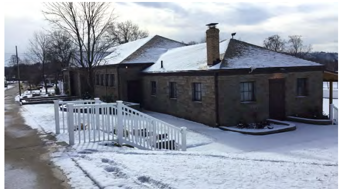
Figure 12. Beaver Pool.