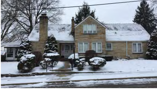
Figure 10. 175 Orchard Street