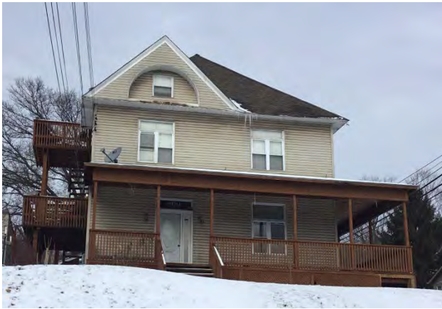
Figure 17. 800 Fifth Street