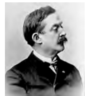
Figure 5 and 6. PA Supreme Court Chief Justice Daniel Agnew (top) and Senator Matthew Quay (bottom)