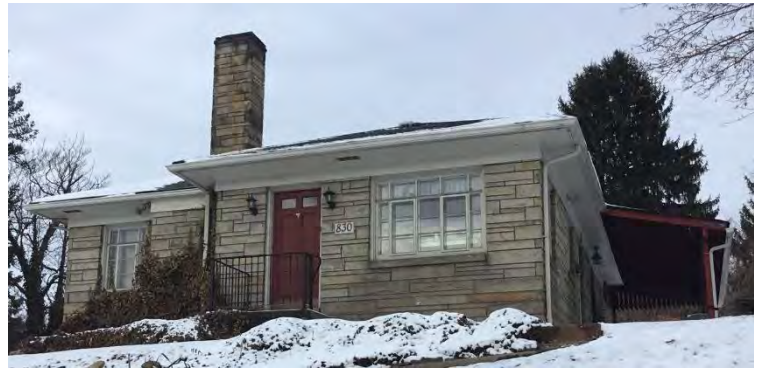
Figure 15. 830 Fifth Street