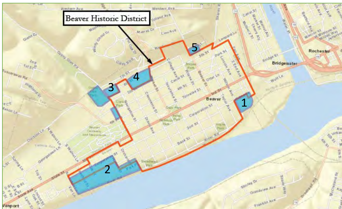
Figure 6 Beaver Historic District with proposed survey areas (in blue)

As part of this planning effort, an historic buildings reconnaissance-level field survey was undertaken in early 2018. The purpose of the survey was to in part broaden the knowledge of Beaver's historic architecture and help determine whether the Beaver Historic District boundaries should be amended by including previously excluded areas of the Borough. The survey areas were selected based on recommendations in the 2016 Clio report with input from the survey team and the Preservation Plan steering committee. Over 200 properties were surveyed, focusing on areas and notable buildings located outside of the historic district.