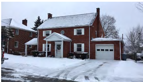
Figure 7. 160 Wilson Street

The Hoopes Plan neighborhood is located outside the Beaver Historic District in the most southeastern section of the Borough. The area is bounded by East Second Street, River Road to the east and south and the east side of Wilson Avenue. The Hoopes Plan neighborhood overlooks the Ohio River to the south. Twenty-four properties were surveyed in this area, all residential. In the late nineteenth and early twentieth century, this area was originally part of