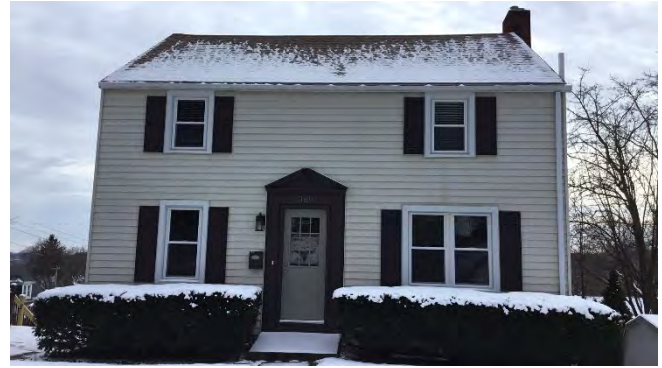
Figure 19. 389 Sixth Street