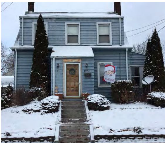
Figure 8. 1295 Park Place

The area southwest of the Beaver Historic District roughly bounded by River Road, Second Street, Sassafra Lane and Sutherland Place was originally developed as the Groveland Plan. It is mainly comprised of modest single-family homes constructed after World War II, however several pre-1940 houses are also found. Some of the homes here were custom-designed for employees of Michael Baker Engineering, which was based in Beaver at that time. One hundred thirteen buildings were surveyed in the Groveland Plan neighborhood. The streets are laid out in a grid plan and have rear alleys with garages. Many of the houses in the neighborhood may be characterized as Minimal Traditional, while some higher styles of architecture, including Colonial Revival, Tudor Revival and Mid-century Modern are found here. Much as with the Hoopes Plan neighborhood, most of the houses in the Groveland Plan neighborhood have been altered by the application of vinyl siding and replacement windows. Mid-century Ranch houses can also be found in this area. Though the neighborhood boasts a number of houses over fifty years of age, this section of Beaver has a substantial amount of new construction from the turn-of-the-twenty-first century. 100 Chestnut Street is a fine and intact example of mid-twentieth century Colonial Revival architecture and is recommended to be evaluated for potential National Register significance.