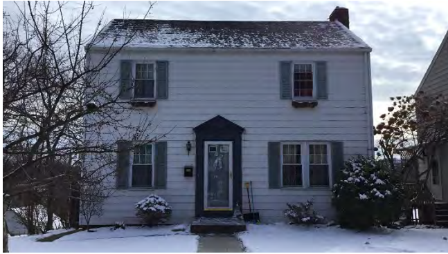
Figure 18. 381 Sixth Street.

Situated on a small, dead-end extension of Sixth Street northeast of the Beaver Historic District, this area is a cluster of twelve Minimal Traditional single-family homes constructed after World War II. The buildings are nearly identical two-story, three-bay houses with traditional/Colonial Revival architectural elements. The majority of the buildings are on Sixth Street, however three are located on adjacent Spring Lane and Beaver Street. Some of the houses on the south side of Sixth Street have rear garages which front Leopard Lane.