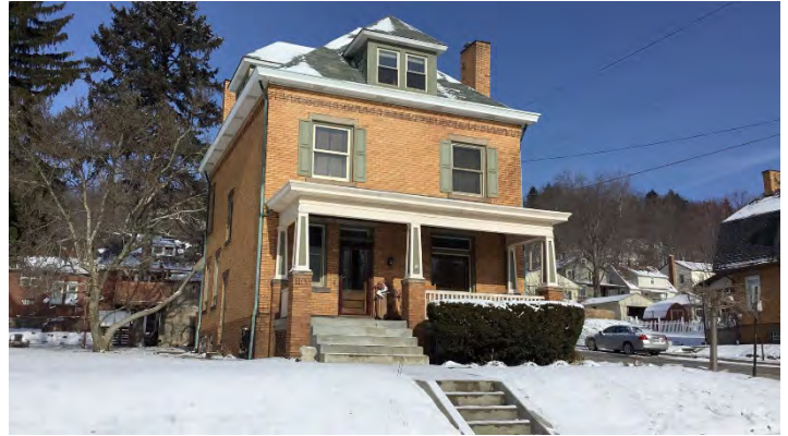
Figure 11. 1100 Sixth Street

Located northwest of the Beaver Historic District near the Beaver Borough/Brighton Township municipal line, this area includes the 1100 block of Sixth Street between Navigation and Buffalo Streets as well as the Beaver Pool at 799 Buffalo Street and 1090 Seventh Street. A total of 25 properties were surveyed in this area. This area is among the older sections outside of the Beaver Historic District and has limited newer construction. Nearly a third of resources are American Foursquare-style residences dating from the first decades of the twentieth century. One such house, 1100 Sixth Street, is an exceptional example of the type. It is of buff brick construction and retains most of its original architectural detailing including copper flashing and gutters, stained glass windows and original wooden doors. It also has an early twentieth-century hipped-roof garage in the rear. This area of Beaver continued to be developed throughout the twentieth century and includes Minimal Traditional and Ranch style houses along Sixth Street.