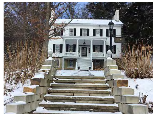
Figure 20. 1090 Seventh Street

The Borough should continue and complete an historic properties survey for the portions of the Borough yet to be surveyed. The HARB should continue to inventory properties within the Borough that are outside the district boundary.