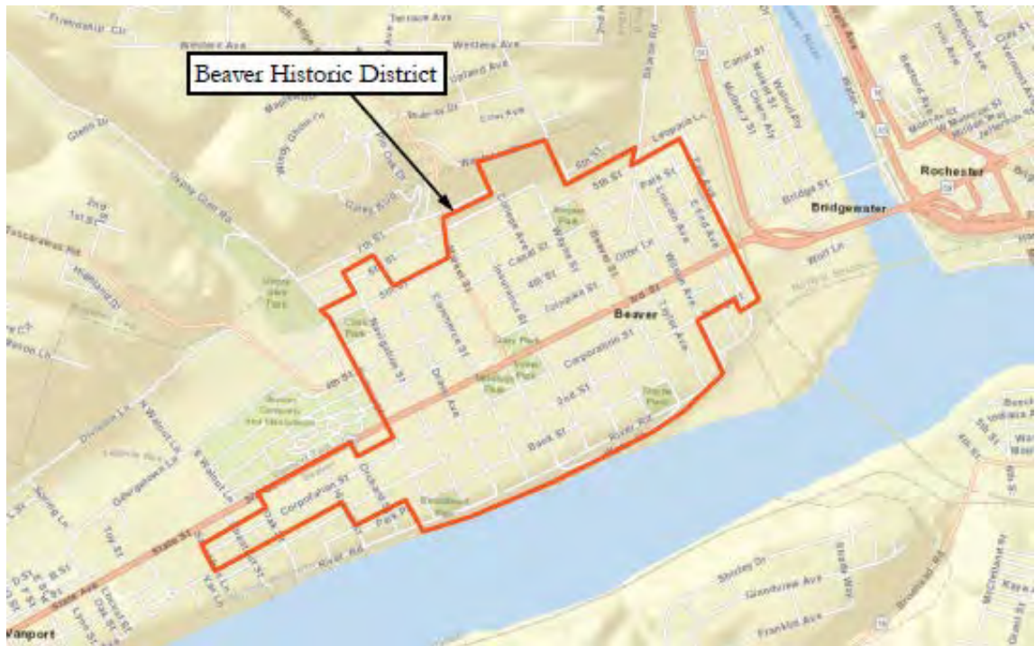
Figure 1 Beaver National Register and Local Historic District

Municipalities are enabled through the state’s Historic District Act and the Municipalities Planning Code to manage inevitable changes to historic resources through ordinance or zoning. In turn, these efforts can only be successful with sound planning efforts and public participation.