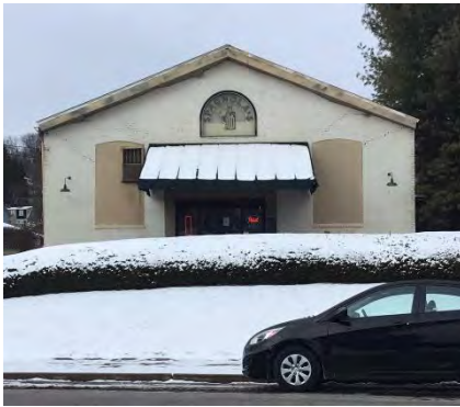
Figure 14. Silverman Distributing Company.

This small four-block area is located on Fifth and Sixth Streets between Dravo Avenue and Market Street, directly north of the Beaver Historic District. Thirty six properties were inventoried in this area, which is primarily comprised of Minimal Traditional and Ranch style residences constructed in the mid-twentieth century. This area also boasts a collection of modest one-story stone-veneered houses, likely constructed by local contractor Frank Catenese. The area also includes two rather heavily-altered nineteenth century houses, 800 Fifth Street and 964 Sixth Street and the only commercial property surveyed as part of this endeavor: the WH Silverman Distributing Company, formerly the Metal Products Co. Ornamental Metal Works/TM Fitzgerald Greenhouses. The Frank Catenese-built houses deserve further study as examples of mid-twentieth century “minimal-traditional” stone houses.