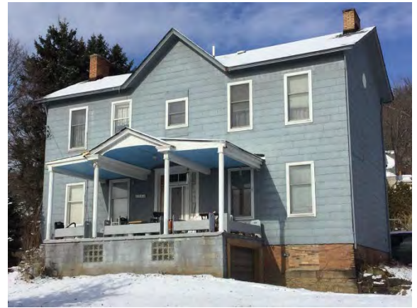
Figure 16. 964 Sixth Street