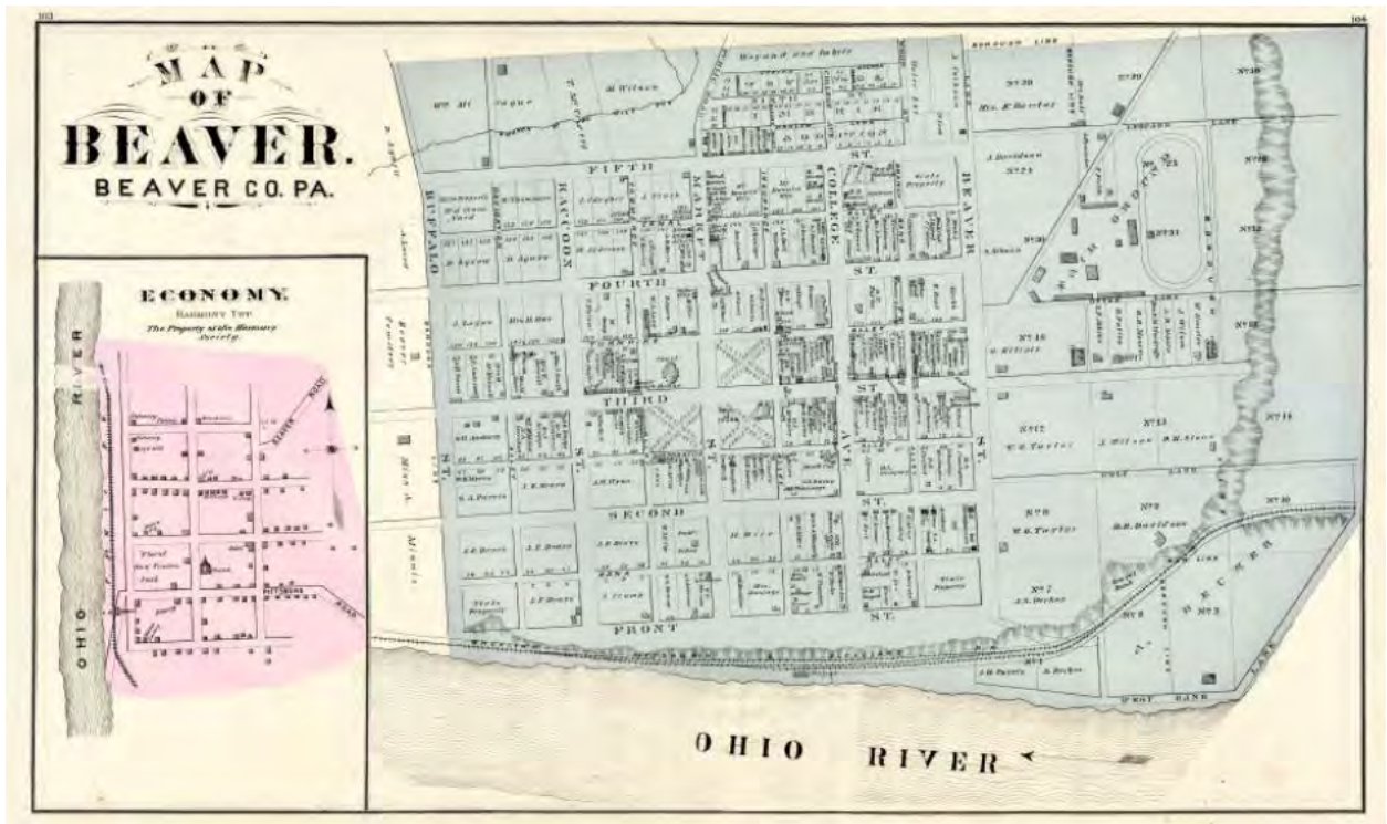
Figure 4. Beaver in 1876.

Beaver became the county seat in 1800 when the County of Beaver was formed; it became a Borough in 1802. Court was first held here that year, in the house/tavern of Abner Lacock, who was also judge and later a U.S. Senator. The first court house was built in 1804 presumably on what is now Agnew Square, one of the public lots laid out by Daniel Leet. A large Second Empire style courthouse opened in 1877, although it was destroyed by fire as the result of a painter’s torch igniting a bird nest in 1932. The courthouse was rebuilt in 1933 in an Art Deco Style. The current courthouse opened in 2003.