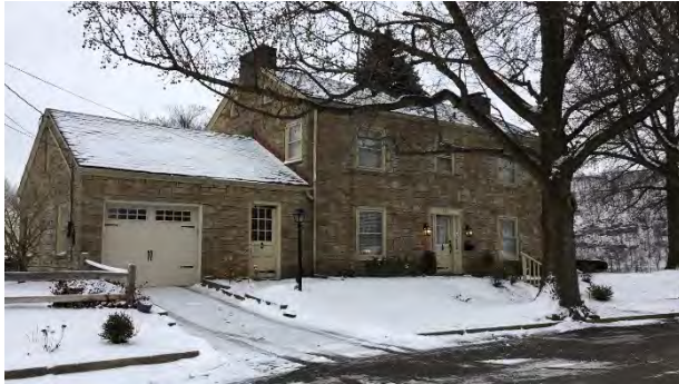
Figure 9. 100 Chestnut St