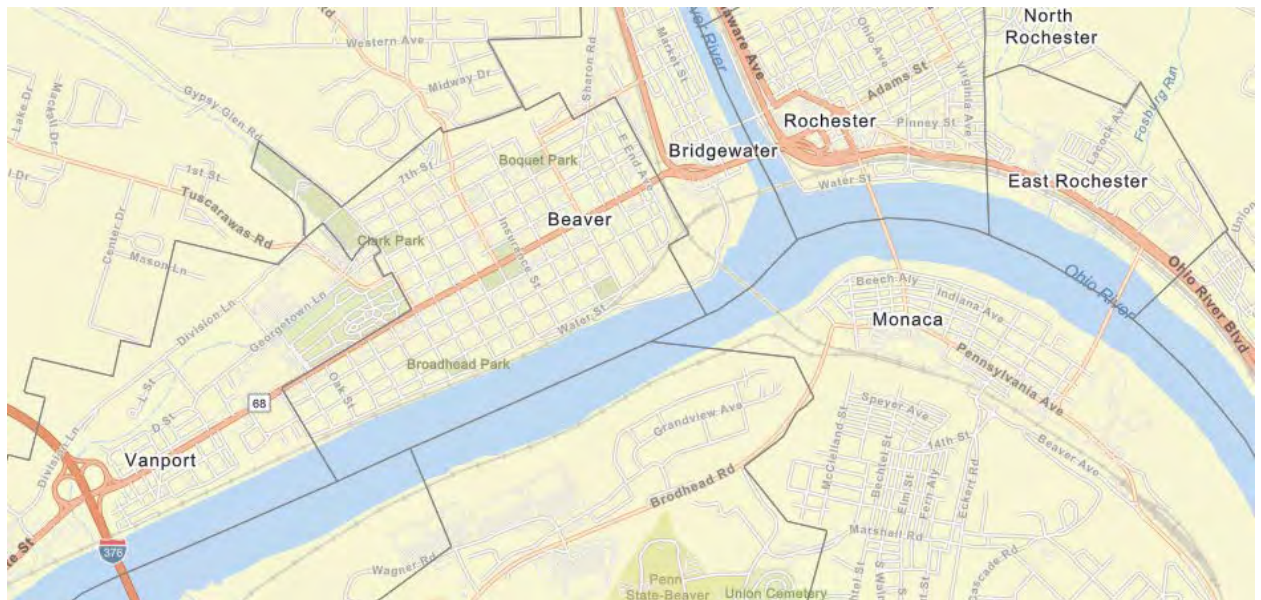
Figure 2. Regional map.

Perched on a plateau overlooking the bucolic Ohio River, it is sometimes difficult to believe the Borough of Beaver Pennsylvania is located in one of the great industrial regions of the United States. The Beaver county seat, it is a beautiful community with fine houses, lovely parks, and a forested escarpment across the river. Beaver's wide tree-lined streets and stately homes, its many parks and lovely but bustling downtown, seem separated, but certainly not cut-off, from the history that surrounds it. Indeed, one need only be in Beaver a short time to appreciate the industrial areas that surround it. Freight trains continually pass by on tracks along the Ohio River, as do barges on the river itself. The scenic Beaver Bridge (1910) carries additional freight over tracks adjacent to the former Pittsburgh and Erie Railroad freight and passenger stations. Just east of Beaver, in Bridgewater, is the former canal along the Beaver River, the Borough's namesake. Immediately west of Beaver, in Vanport, is the former Curtiss Wright plant, an aircraft propeller plant built during World War II. The history of industrial concerns in the Beaver area continues today, as a new industrial facility, Shell Appalachia's ethane cracker plant rises at the time of this writing across the Ohio River southeast of the Borough.