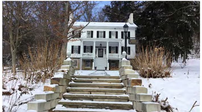
Figure 13. 1090 Seventh Street

Along with 1100 Sixth Street, several resources in the survey area appeared to have some level of historical or architectural significance. 1090 Seventh Street is a circa 1835 brick Federal style house which has a high degree of architectural integrity. Its early age, architectural details and integrity makes this house a rather significant resource in the Borough. The Beaver Pool, a Works Progress Administration-built complex located at 799 Buffalo Street and stone pool house, constructed circa 1935, contains many of its original features including window features with leaded glass fixtures. These three properties: 1090 Seventh, the Beaver Pool and stone pool house, should be further documented to determine their eligibility for listing in the National Register of Historic Places. On the south side of the 1000 block of Sixth Street, a row of fine American Foursquare houses also merit further study.