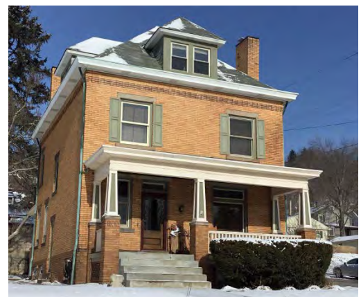
Figure 21. 1100 Sixth Street.