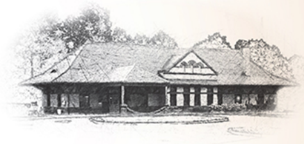
BEAVER STATION CULTURAL & EVENT CENTER

Beaver Tales Storytelling • Collection & Research Center • Concert in the Park • Educational Programming for Children & Adults 1802 Log House • Fort McIntosh Site • Garrison Day • Memorial Day Parade • Rotating Museum Exhibits • Station Signature Events