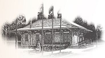
BEAVER AREA HERITAGE MUSEUM