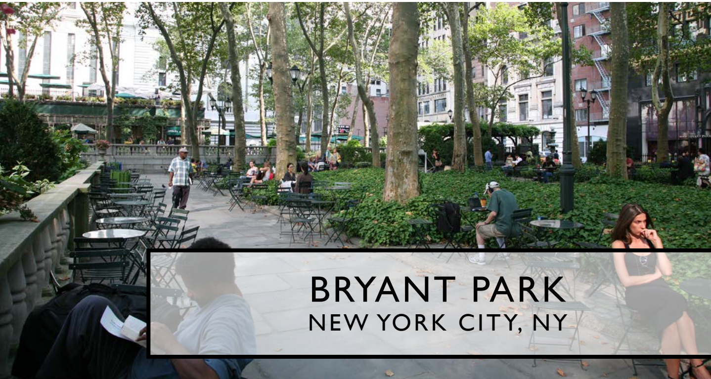
BRYANT PARK NEW YORK CITY, NY