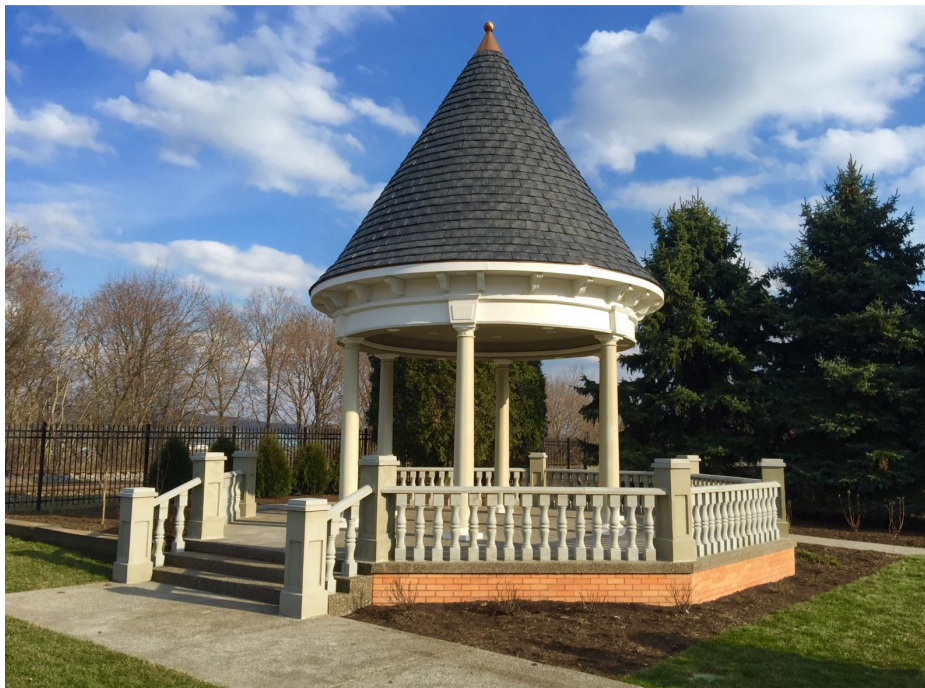
The newly unveiled Belvedere at Beaver Station Cultural & Event Center. Recognize the turret? It was salvaged from the old Cunningham mansion that used to stand at the corner of Beaver and Second streets.