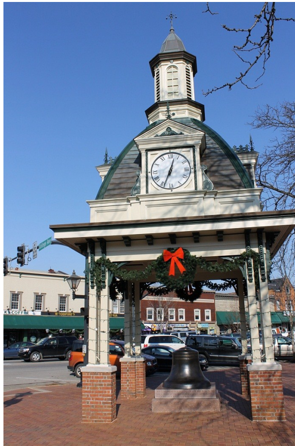
The newly cleaned and repainted 1877 Clock Tower on the corner of College Avenue and Third Street.

In recent years, a total of 20 memorial benches have been purchased by local citizens and placed along Third Street. With continuous exposure to the elements, some benches have developed surface damages. Beginning this month, all the benches will be temporarily removed and returned to the manufacturer for refinishing, at no charge to the Borough. By early spring, all will be returned to their original places.